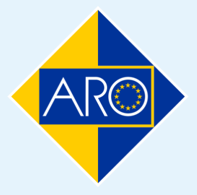
Figure 4: logo of the EU asset recovery offices

In response, in 2023, the European Parliament agreed on new measures to expand the mandate of these offices, allowing them to urgently freeze property when there is a risk that assets could disappear. This marked a step towards the adoption of a new directive on the freezing and confiscation (European Parliament 2023).